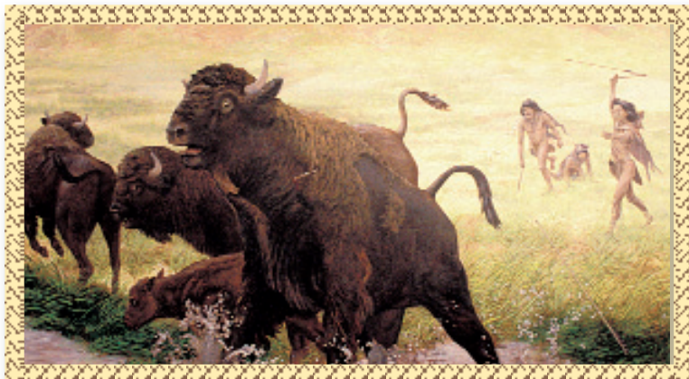
ILLUSTRATION BY TPWD

Long before we could pick up a bucket of fried chicken or a bag of cheeseburgers and fries, people used weapons and traps to catch their food. We still do, every time we hunt or fish.