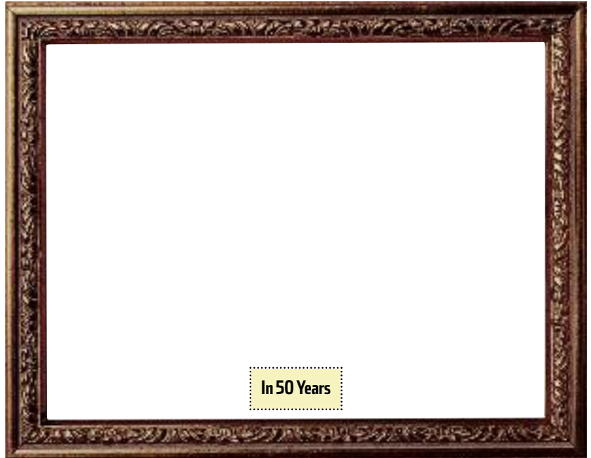
In 50 Years

Some animals, like frogs, can change quite a bit from the time that they are born to when they are fully grown adults — and so do we! Find a picture of yourself as a baby, and compare it to a picture of yourself now. How have you changed? What do you think you'll look like in five years? In 10 years? In 50 years? Draw a picture of what you will look like in 50 years.