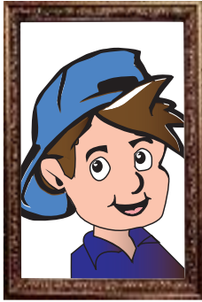
In 10 Years