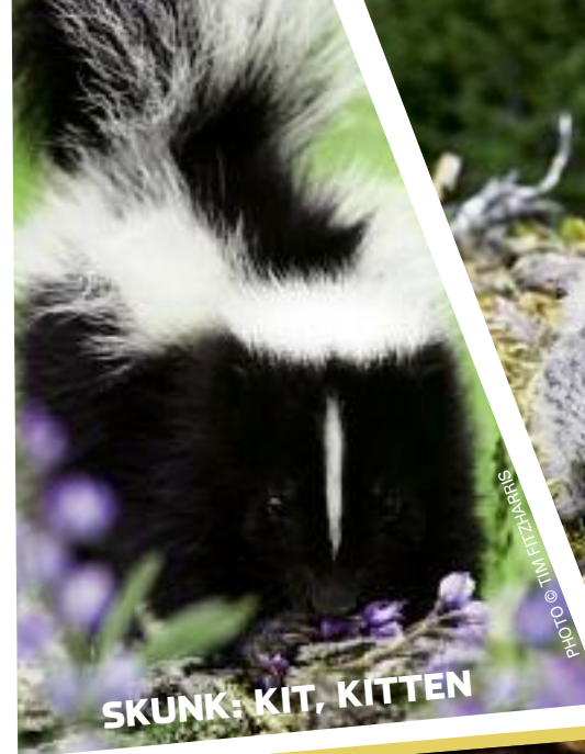
SKUNK: KIT, KITTEN